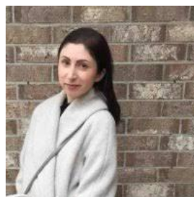
Rebecca Fera Events